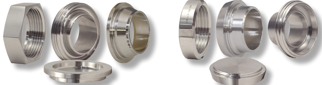
RJT BS: 4825